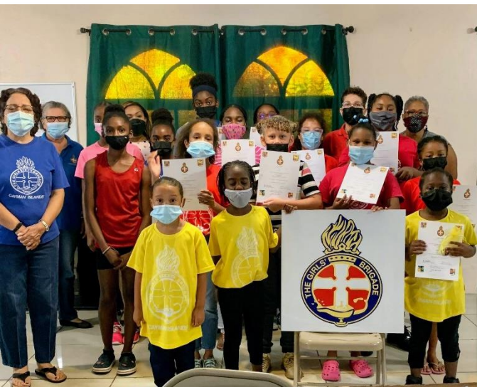
The Savannah United Church Girls Brigade Award Ceremony was held on Wednesday, June 22, 2022.