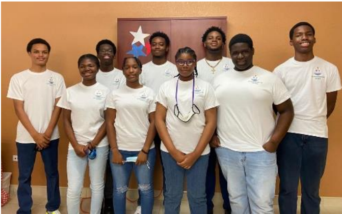
The Savannah United Church Youth Discipleship Group

On June 26, 2022, the Savannah United Church Youth Discipleship expressed their appreciation to the Royal Cayman Islands Community Policing Department for their partnership in their Carwash Fundraiser in aid of the North Sound Gardens Community Park Revitalization Project.