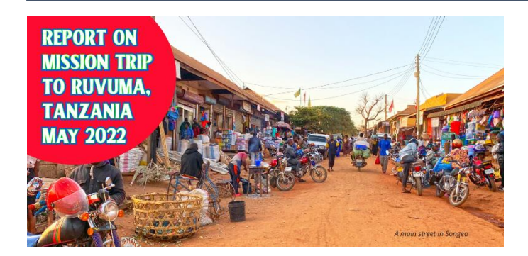
By the Tanzania Mission Team

UCJCI 42<sup>nd</sup> SYNOD THEME - Rooted, Resilient: Responding in HOPE (Health, Opportunity, Peace, Evangelism)