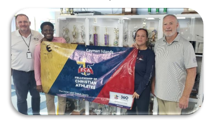
Visit to the John Gray High School.