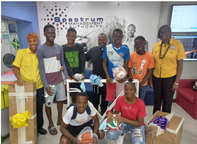
Spectrum Management Authority donates sports equipment to St John's United Church in Hannah Town for youth/community ministry.

On any evening, at least thirty to fifty youngsters, ages eight to 17, from beyond Hannah Town gather on the compound of the church where they play sports or just hang out. The game of choice is mostly football in the scrimmage format. The church has provided a safe space for them and the church has identified and embraced this as a ministry opportunity.