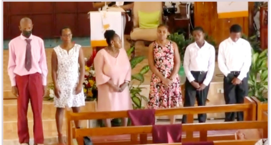
Candidates for Baptism