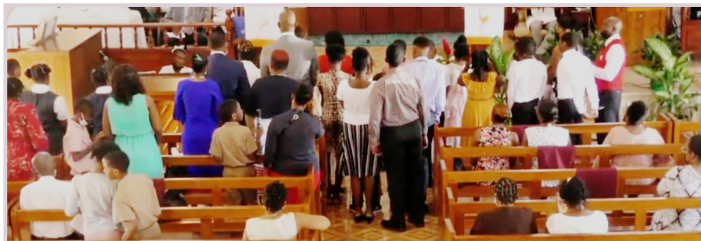
Special Prayer for our nation's children/schools. Bridgeport High School represented the island in the sanctuary.