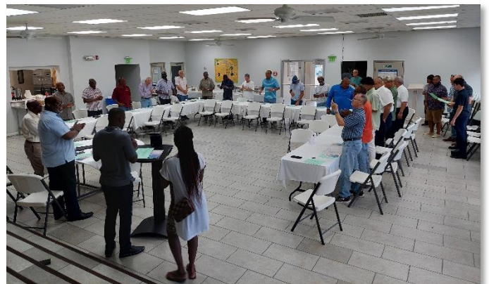
Participation in the Men's Fellowship Breakfast held at the John Gray Memorial United Church