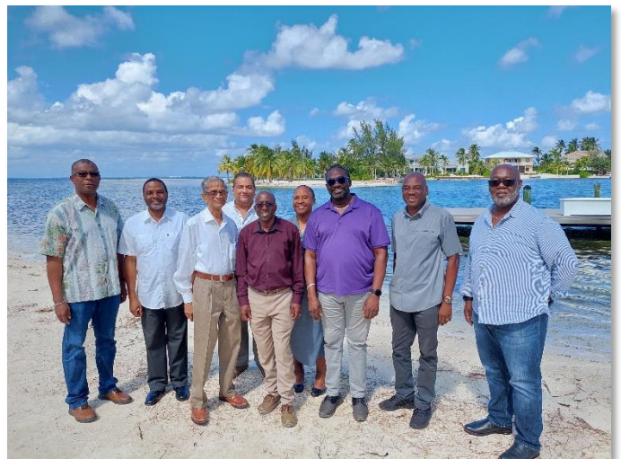
Group photo from the Moderator's Retreat with Ministers and Lay Pastors in Cayman Kai