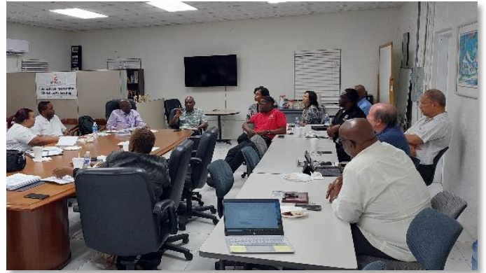
Meeting with Council Members at the Council Office

The Moderator and the General Secretary concluded their visit to the CIRMC on October 31, 2022.