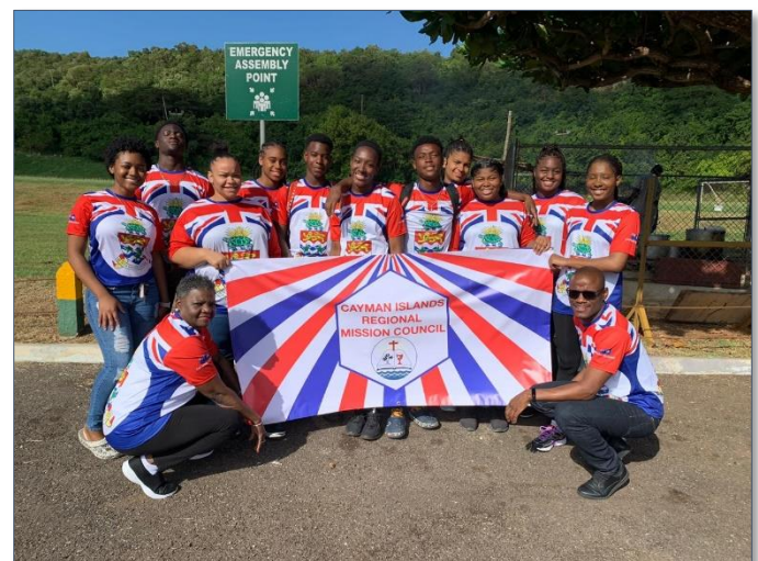
The 2020 Cayman Team with their newly designed banner.

This year we hope to assemble a team of about 16 young persons from our Charges, accompanied by 5 leaders, to travel and represent our Regional Mission Council in various Track and Field categories.