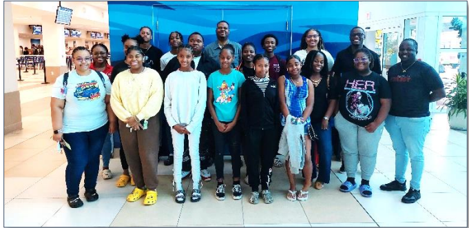
Ready to depart from Grand Cayman.

Over the weekend of March 17-19, 2023 a group from the Cayman Islands Regional Mission Council (6 leaders and 13 youth) attended the United Church Young People's Fellowship (UCYPF) National Sports Day in Jamaica. A small group that did GREAT things.