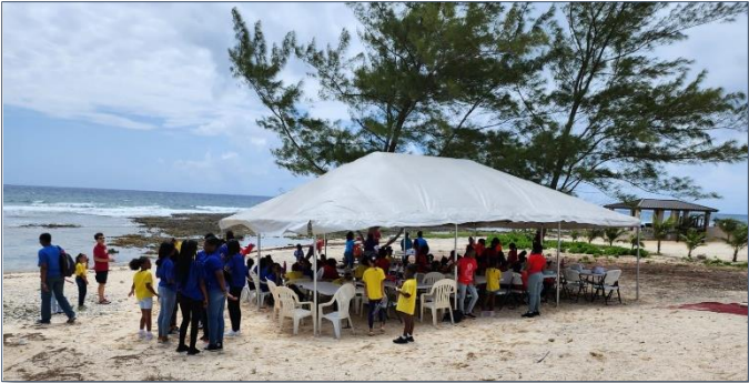
Old Timers' Corner