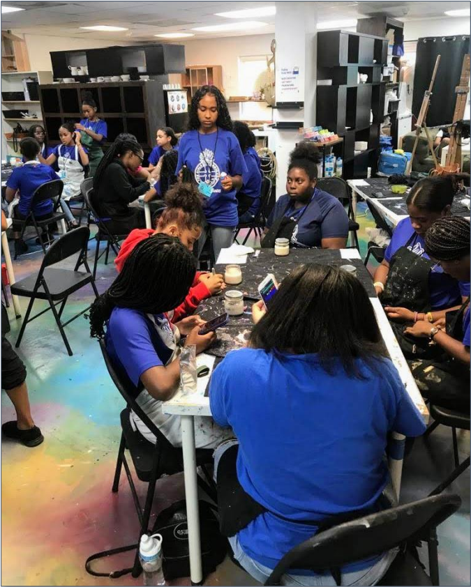
The Seniors and Brigaders went to Art Nest for their craft activity.