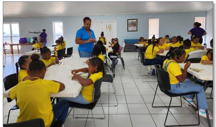
The Explorers engaged in various creative activities at the PYC

The activities of the 2023 Girls’ Brigade Week were brought to a close on Saturday, March 18, 2023, at the Prospect Youth Centre (PYC), where all the Companies joined together one more time to engage in fellowship and fun-filled, creative, and educational activities.