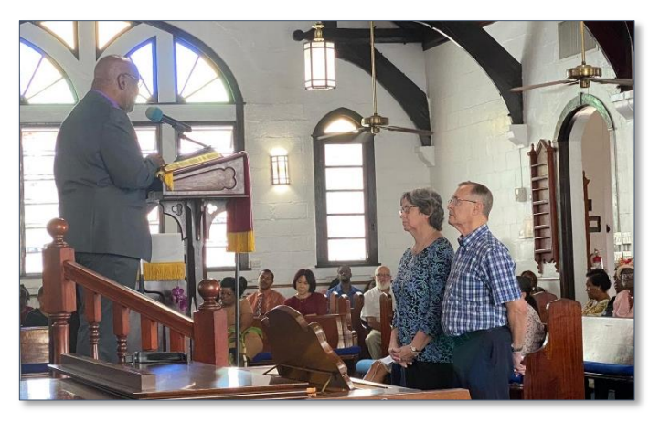
The commissioning of the missionaries at Elmslie Memorial Church.

Let us remember them daily in our prayers and ask God for abundant blessings on their ministry and 'journeying mercies'. Through our prayers, we become their 'partners in the gospel' (Philippians 1:5).