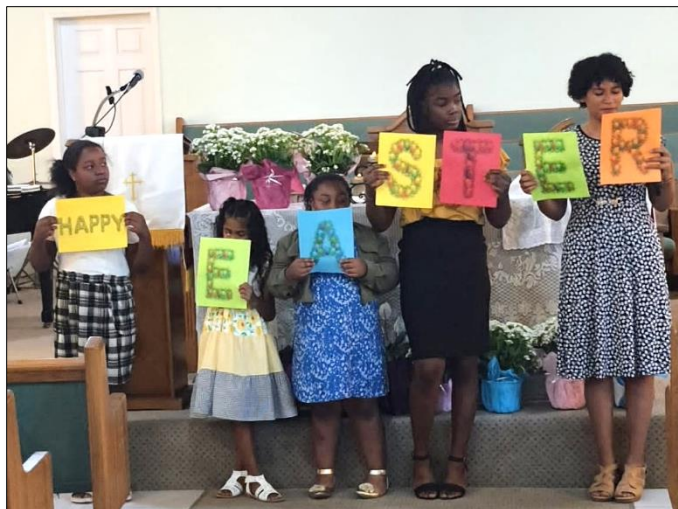
Children at the East End United Church wishing all a Happy Easter!

THE UNITED CHURCH IN JAMAICA AND THE CAYMAN ISLANDS presents