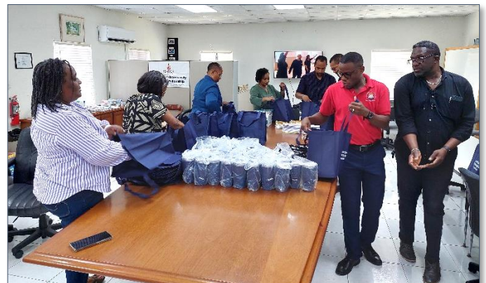
Members of the CIRMC Synod Planning Team prepare the Delegates’ gift bags.