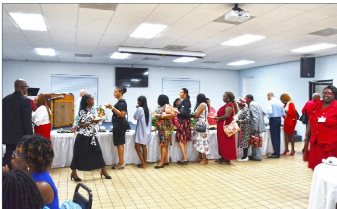
Monday, April 24, 2023 – 1 st Business Day and Moderator's Reception