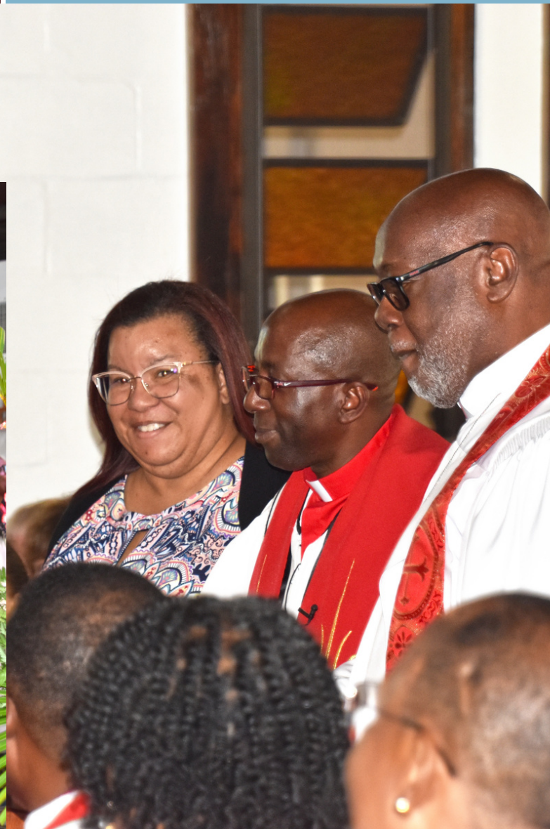
Scenes from services