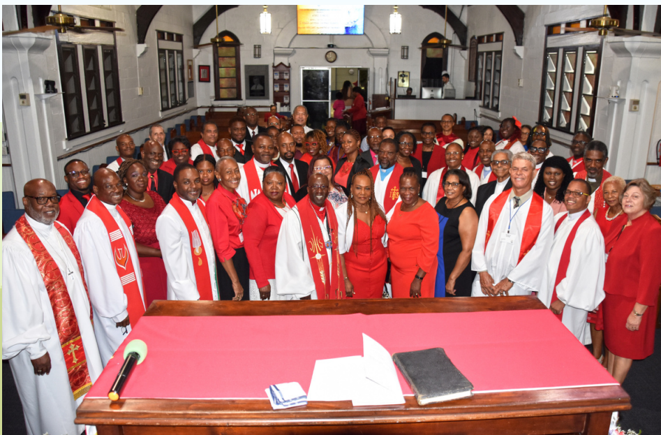
Synod delegates, Ministers and Lay Pastors

Declaring Jesus’ commission in Matthew 28, the Moderator invited members of the United Church to join a movement which “has the potential of turning your family, your community, your nation, and the world around”, beginning with an encounter with Jesus. “All hands on deck, rowing in the same direction”.