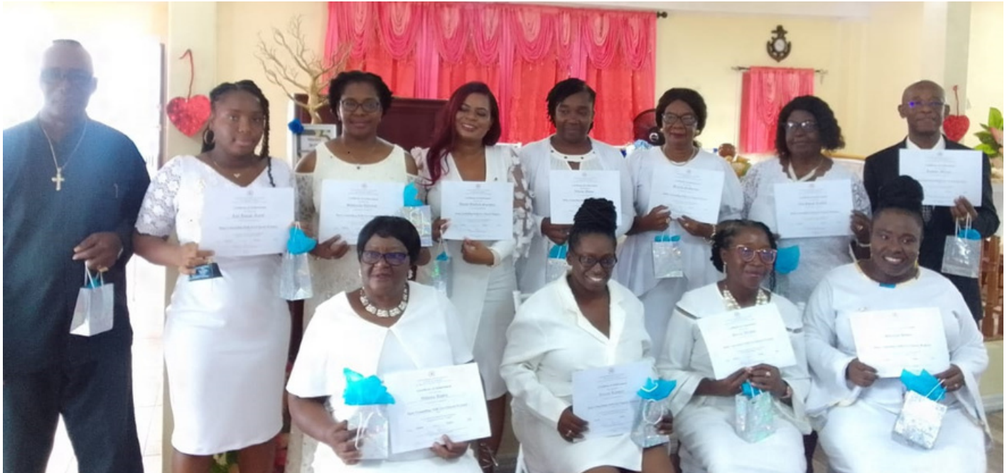
GRADUATES PROUDLY DISPLAY THEIR CERTIFICATES

Over the past two years The Guyana Congregational Union (GCU) has been part of an initiative among churches in a number of denominations in Guyana to increase their impact in the schools across Guyana. In preparation for that thrust, I was invited by the GCU leadership to conduct a week-long training workshop on school chaplaincy.