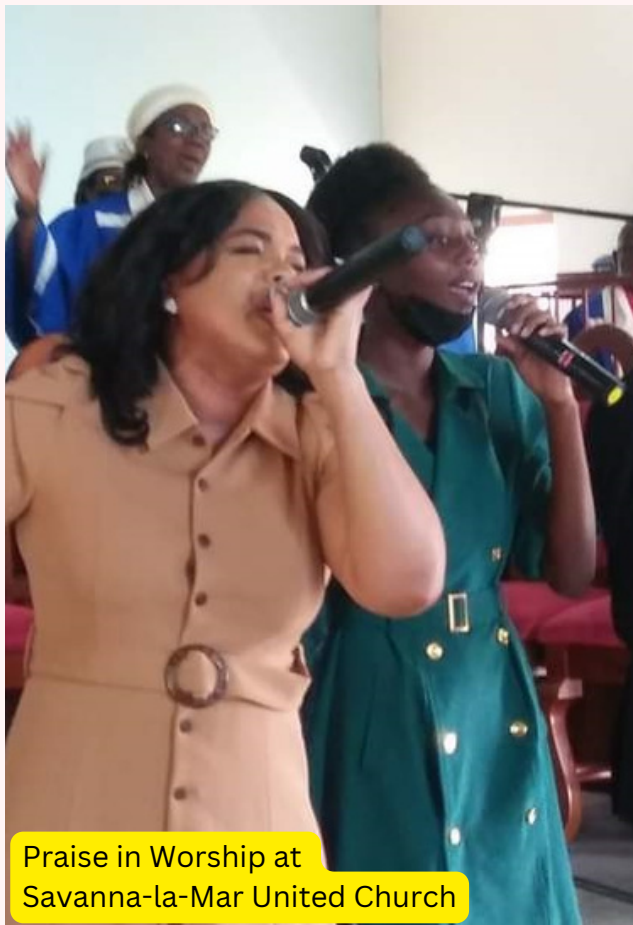
Praise in Worship at Savanna-la-Mar United Church

THE OFFICIAL WEEKLY NEWSLETTER OF THE UNITED CHURCH IN JAMAICA AND THE CAYMAN ISLANDS