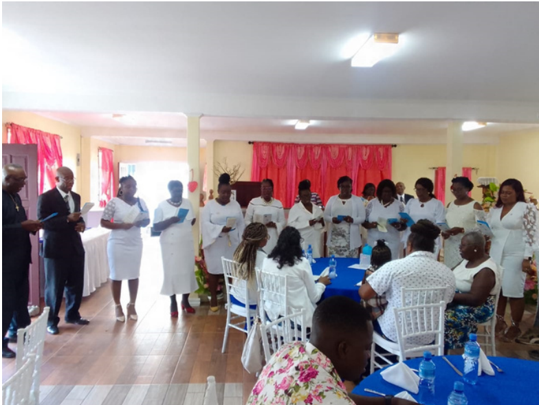
GRADUATES PRESENTED TO THE AUDIENCE

On April 28, 2023 it was my distinct joy and privilege to be the guest speaker at the graduation ceremony for the sixteen GCU trainees who are now equipped to more effectively engage with young people in the school setting. We wish GCU every success as they seek to make an impact on the young people of Guyana.