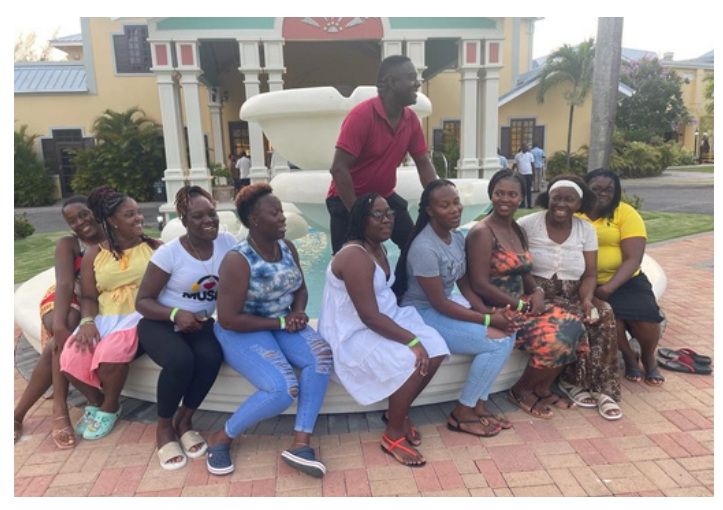
RICHMOND ROAD PRIMARY AT JEWELS RUNNAWAY BAY

Teachers from Richmond Primary and Infant enjoyed their Day Pass at the Jewels Runaway Resort on May 11, 2023. While Teachers from North Street Primary, Seafield Primary and infant and Derry Primary and Infant Schools enjoyed their Day Pass at Bahia Principe Hotel in Runaway Bay on Friday May 19. 2023.