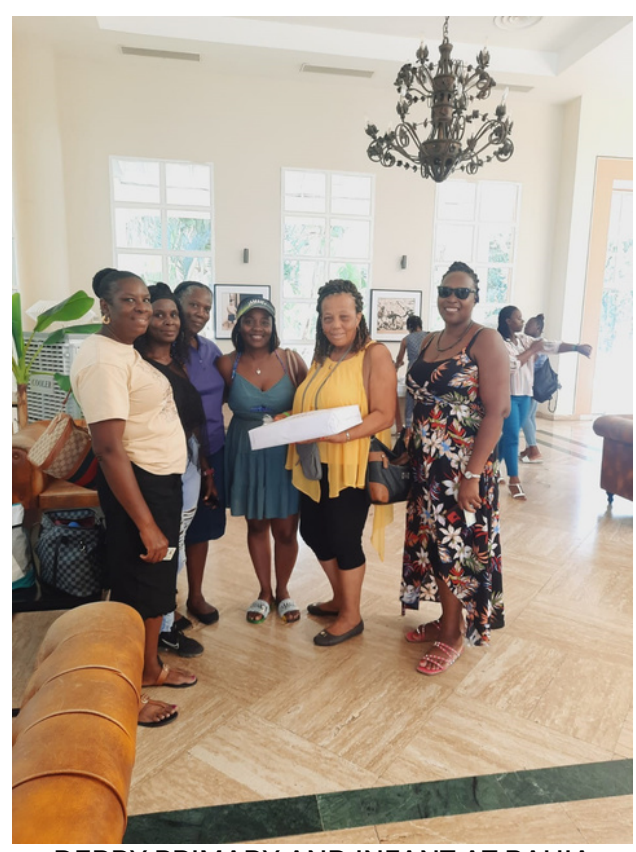
DERRY PRIMARY AND INFANT AT BAHIA PRINCIPE RUNAWAY BAY