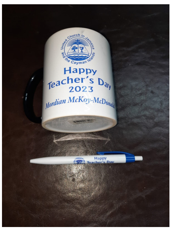
ADDITIONAL GIFTS FOR THE TEACHERS