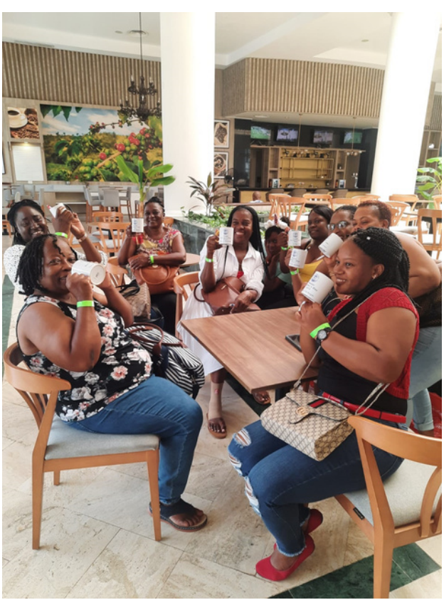
SEAFIELD PRIMARY & INFANT AT BAHIA PRINCIPE RUNAWAY BAY

Personalized tokens were presented to teachers from Seventeen (17) schools in the Council, Eleven (11) in St Mary, Four (4) in St Catherine and Two (2) in Kingston. Each teacher received a Mug with their name and the Church (UCJCI) Logo as well as pens with the UCJCI's logo.