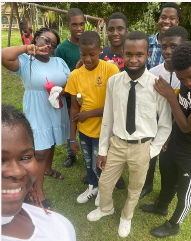
YOUTH FROM ASKENISH UNITED ARE ALL SMILES AFTER YOUTH SUNDAY SERVICE.

THE OFFICIAL WEEKLY NEWSLETTER OF THE UNITED CHURCH IN JAMAICA AND THE CAYMAN ISLANDS