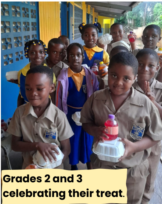
Grades 2 and 3 celebrating their treat.