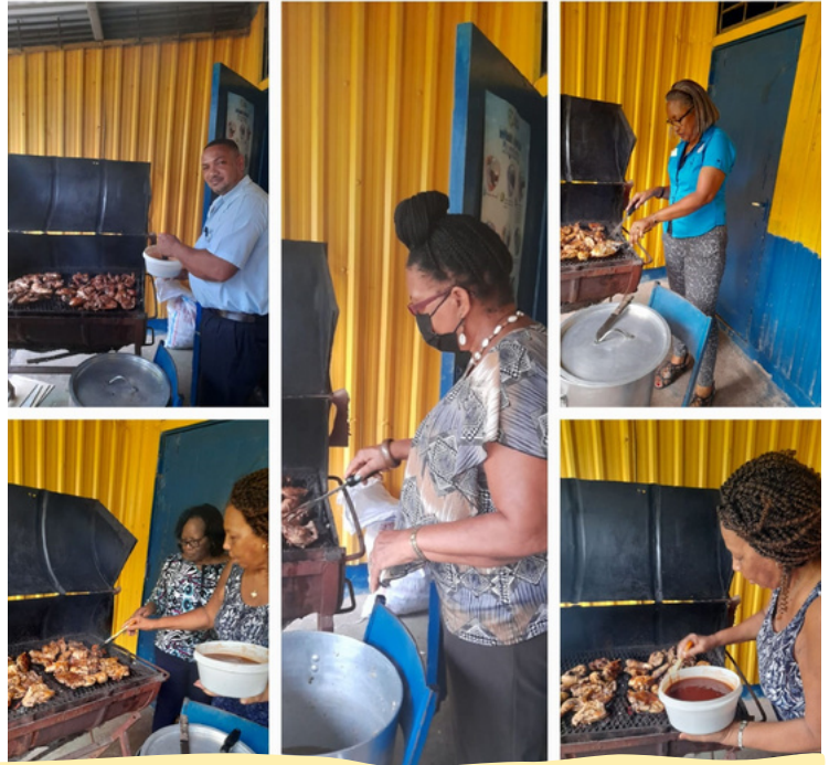
A delectable meal being prepared.