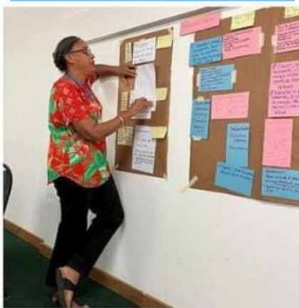
Training in progress.