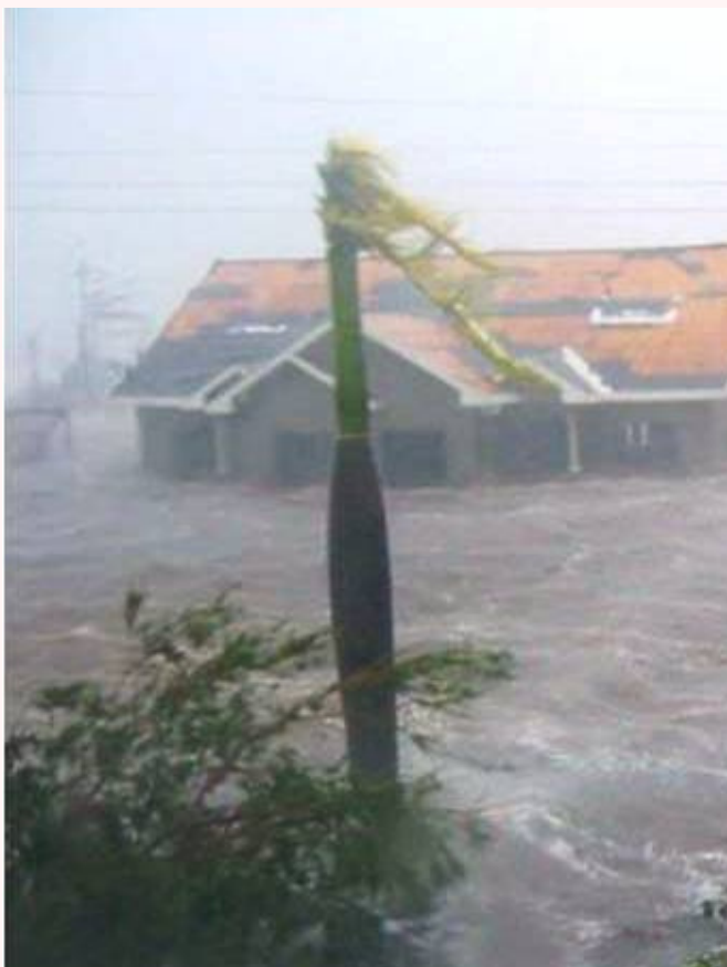
HURRICANE IVAN WREAKED HAVOC IN CAYMAN IN 2004

THE OFFICIAL WEEKLY NEWSLETTER OF THE UNITED CHURCH IN JAMAICA AND THE CAYMAN ISLANDS