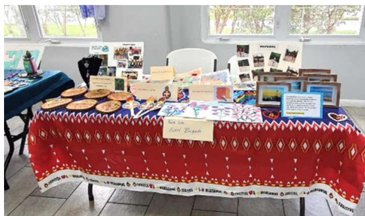
Company displays (above) and girls enjoying fellowship (below)

The girls from various companies across the island displayed their art and craft in the Church Hall.