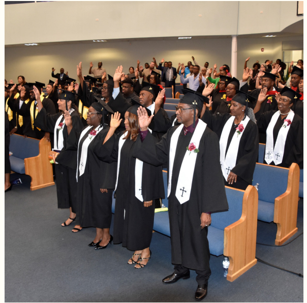
The graduates' degrees are conferred.

CTLT Certificate, Bachelors and Masters students marched into the church, to the tune of "I'm marching upwards to Zion, the beautiful City of God," while their families, came to cheer them on their path.