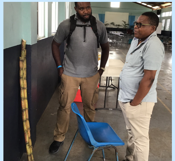
A deep discussion on who gets the last stalk of cane.

"We left that lecture hall far more appreciative of the many opportunities that we have to change our life and health circumstances. We need to be healthy to do the work of ministry."