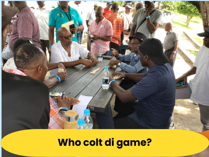
Who colt di game?