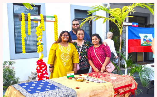
MISSION WEEKEND IN CIRMC P. 10

AS PART OF THE REFORMED TRADITION, THE UNITED CHURCH BELIEVES IN THE PRIESTHOOD OF ALL BELIEVERS. SO MEN AND WOMEN WHO MAKE A COMMITMENT TO BE FOLLOWERS OF CHRIST ARE UNDERSTOOD TO HAVE BEEN ENTRUSTED WITH THE RESPONSIBILITY OF THE WORK OF MINISTRY. IN THE UNITED CHURCH THIS WORK IS CARRIED OUT BY ORDAINED AND LAY PERSONS. UPDATE FEATURES TWO YOUNG PEOPLE WHO ARE BEGINNING PREPARATION FOR ORDAINED MINISTRY. READ PAGES 2 AND 3