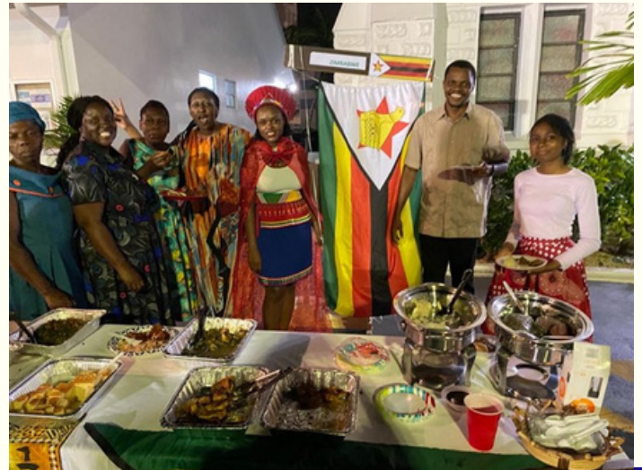
Youth Night – Zimbabwe