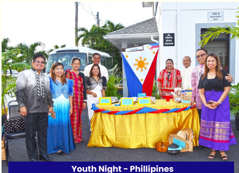
Youth Night – Philippines