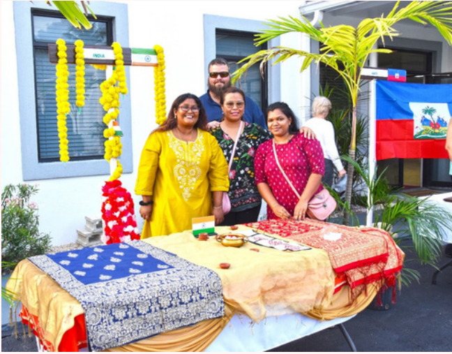
Youth Night - India