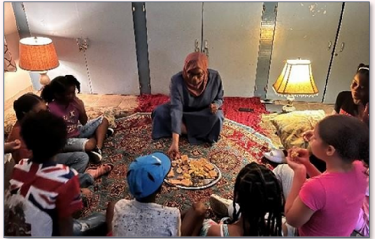
Youth Night - Saudi Arabia