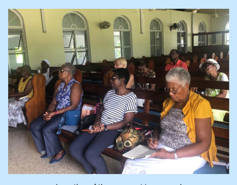
A section of the group at Immanuel.

On World Alzheimer's Day, September 21, the Immanuel United Church in association with Alzheimer's Jamaica supported the Memory Club in commemorating the day. The Tri H-Help, Hope & Health Memory Club, is a safe, stigma-free environment where caregivers, families and persons living with early stage of Alzheimer's come together. The group meets every third Wednesday from 10 am-12 noon to share memories, encouragement, health tips and self-care strategies in a serene atmosphere and with light refreshments.