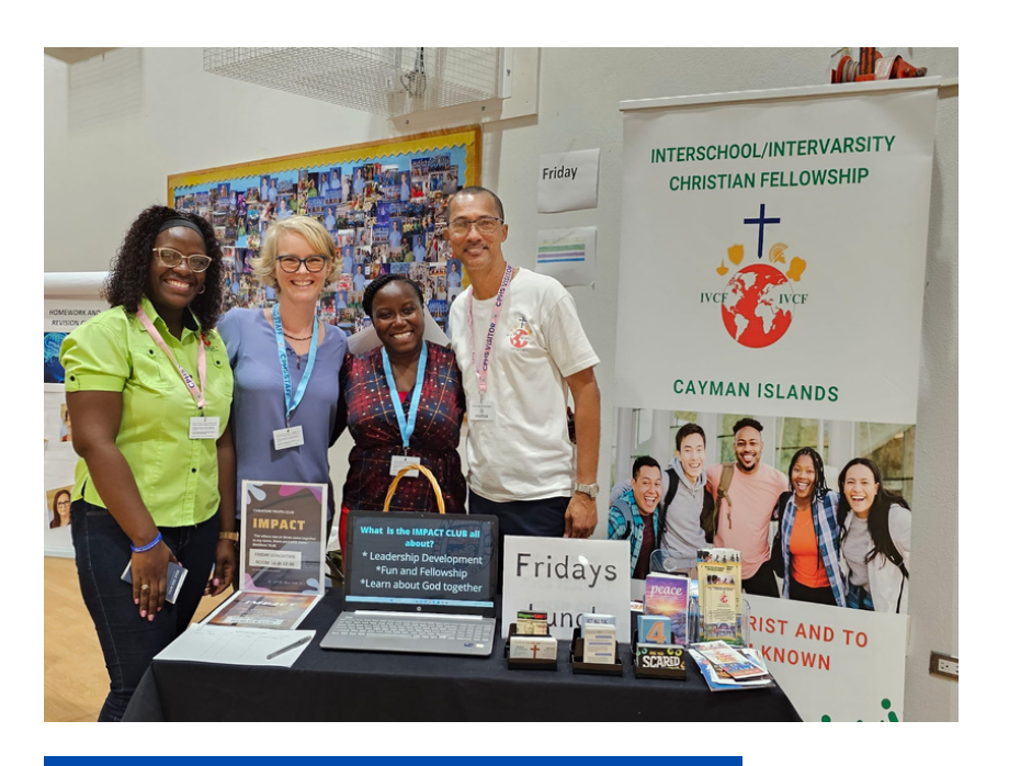
IS/IVCF Club sign up Day at CPHS (Cayman Prep and High School)

As a para-church organization, our vision is to see students transformed by the Gospel and then impact their schools, their churches, and their communities. Many students choose whether not they or attend a church regularly, but they spend several years in the schools, so we believe that our campuses provide one of the greatest platforms for ministry. The harvest is indeed ripe, and invitations are out for labourers. IS/IVCF will also have a 10th Anniversary Fundraising Dinner on Saturday, November 4, 2023, at Ristorante Pappagallo.