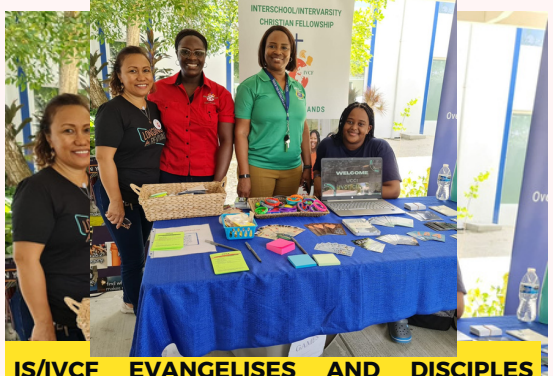
STUDENTS IN THE CAYMAN ISLANDS P. 5

THERE ARE YOUNG PEOPLE WITH EDUCATIONAL NEEDS LIVING IN COMMUNITIES WHERE UNITED CHURCH CONGREGATIONS ARE LOCATED. THERE ARE EFFORTS BY INDIVIDUALS, GROUPS AND ORGANISATIONS TO JOIN FORCES TO PROVIDE MUCH NEEDED HELP. READ ABOUT A PARTNERSHIP BETWEEN HELLSHIRE UNITED CHURCH AND THE FAMILY OF A FORMER MINISTER OF THE UNITED CHURCH TO COME ALONGSIDE FIVE YOUNG PEOPLE TO IMPROVE THEIR EDUCATIONAL PROSPECTS. MORE EFFORTS SUCH AS THESE ARE NECESSARY SO THAT EDUCATION IS ACCESSIBLE FOR ALL YOUTH. (PAGES 5 AND 6)