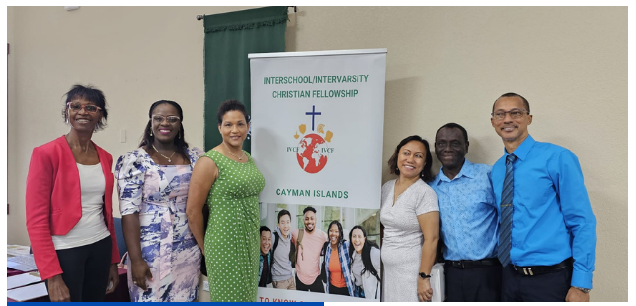
Church Tour stop at the Savannah United Church.

The Inter-School/Inter-Varsity Christian Fellowship