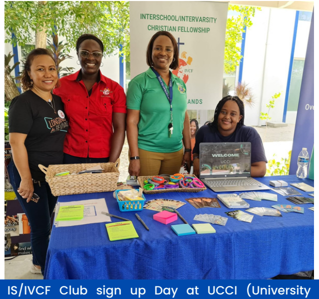
IS/IVCF Club sign up Day at UCCI (University College of the Cayman Islands)

IS/IVCF is also having a 10th Anniversary Church Tour. We hope to visit as many churches as possible to thank our partners for supporting our non-profit ministry, spread awareness about our work to parents/guardians, and invite individuals to partner with us with their time, talent, and treasure.