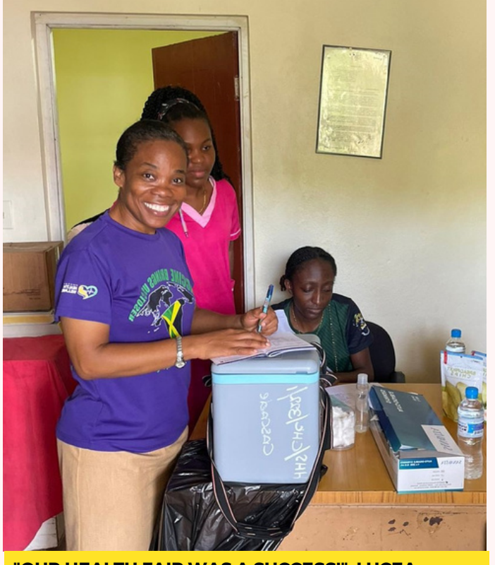
"OUR HEALTH FAIR WAS A SUCCESS!" LUCEA UNITED CHURCH. PAGES 5 AND 6

THE OFFICIAL WEEKLY NEWSLETTER OF THE UNITED CHURCH IN JAMAICA AND THE CAYMAN ISLANDS