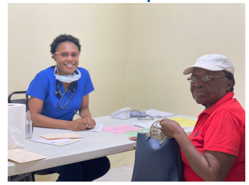
HUNDREDS OF MEDICAL EXAMINATIONS WERE DONE.