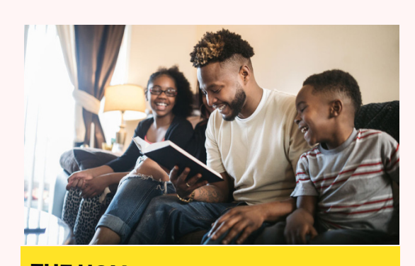
THE HOME - POWERHOUSE FOR TRANSFORMATION.

"THE HAND THAT ROCKS THE CRADLE IS THE HAND THAT RULES THE WORLD", A POEM BY WILLIAM WALLACE, HOLDS WITHIN IT THE BELIEF THAT THE WHOLE WORLD MAY BE IMPACTED BY THAT WHICH HAPPENS WITHIN THE CONTEXT OF HOME. THIS EXTENDS WALLACE'S PLACEMENT OF POWER IN THE HANDS OF MOTHERS. OUR FEATURE ARTICLE PRESENTS THE POSSIBILITIES FOR TRANSFORMATION OF INDIVIDUALS, AND BY EXTENSION, THE BREADTH OF COMMUNITY - LOCALLY, REGIONALLY AND GLOBALLY - BY THE RENEWAL OF MINDS ACCORDING TO THE WILL OF GOD. READ ABOUT THIS IN A REFLECTION ON THIS WEEK'S WORSHIP THEME (PAGES 2 -4)