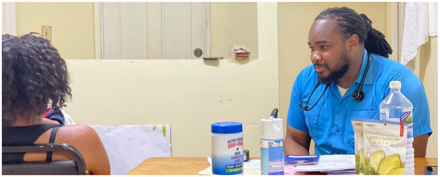
A BENEFICIARY RECEIVES MEDICAL ATTENTION.