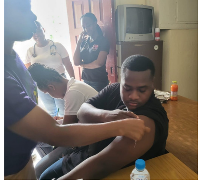
SCORES OF VACCINATIONS WERE GIVEN.

We are forever grateful and look forward to working together to make an even bigger impact on health and wellness in Jamaica in the near future.