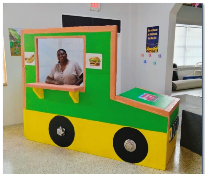
The Food Truck

The children thoroughly enjoyed the VBS. It was good listening to them shout out on the last day all the things they learned. For the closing activity, they had a piñata as a surprise.