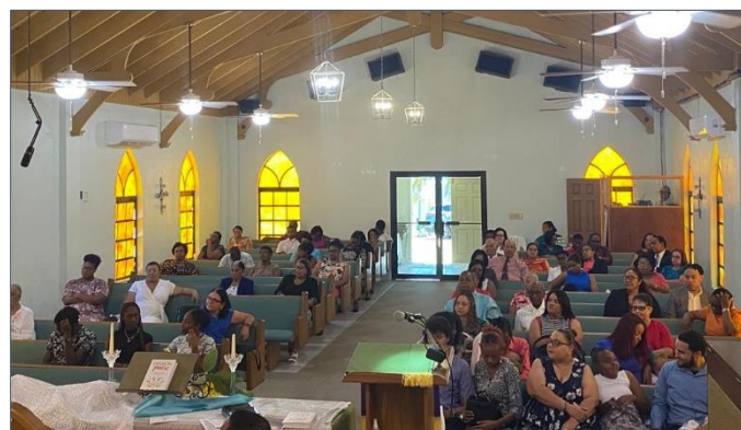
Sunday morning at the East End United Church