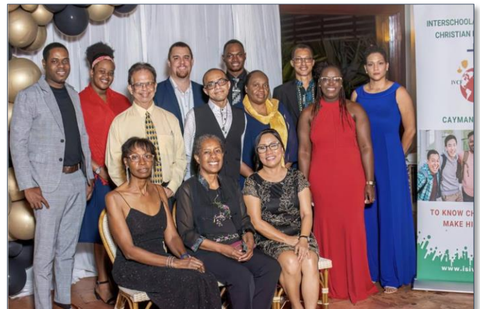
The Board of Directors of the IS/IVCF Cayman Islands.

The ministry recently celebrated its 10th anniversary with a Fundraising Dinner on Saturday, November 4, 2023, at Ristorante Pappagallo. The board of directors and staff are very grateful to those who were able to support the event and crave continued prayers and support as they seek to evangelize and disciple the youths of these islands.