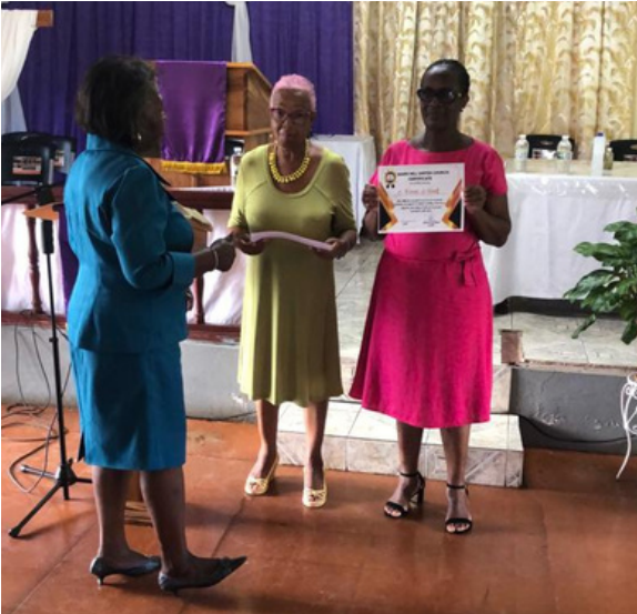
James Hill United Church

Thank you to our teachers and administrators