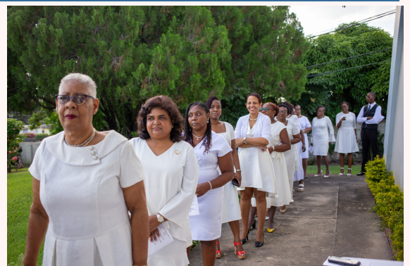
GRADUANDS LINED UP TO ENTER HOPE UNITED CHURCH FOR THE LAY LEADERS' TRAINING GRADUATION CEREMONY. (PAGES 4 AND 5)