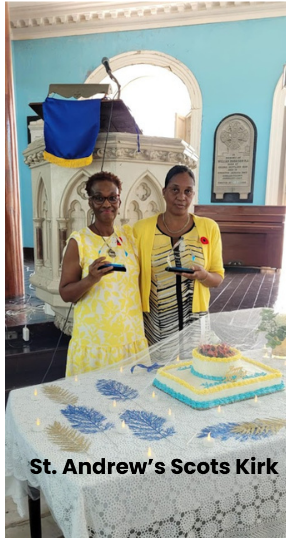
St. Andrew's Scots Kirk

Thank you to our teachers and administrators