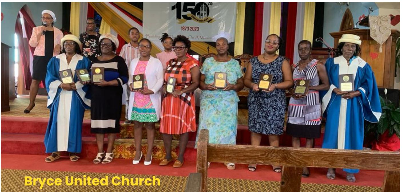
Bryce United Church