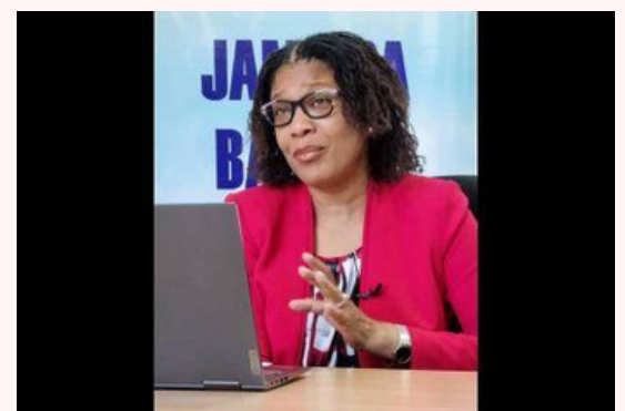
"GENDER-BASED VIOLENCE DENIES HUMAN DIGNITY." (PAGE 6)

I HAVE OFTEN HEARD THE QUESTION, 'WHAT IS THE POINT IN WEARING BLACK ON THURSDAYS?' PERHAPS THERE IS NO POINT AT ALL. CERTAINLY IF IT IS PURELY A FASHION CHOICE THEN THE THURSDAYS IN BLACK CAMPAIGN WOULD HAVE MISSED ITS GOAL. THE CAMPAIGN IS INTENDED TO RAISE AWARENESS OF VIOLENCE AGAINST WOMEN AND GIRLS WITH A VIEW TO BRING AN END TO SUCH CRUELTY.. READERS OF UCJCI UPDATE ARE ENCOURAGED TO NOT ONLY WEAR BLACK ON THURSDAYS, BUT TO BEGIN CONVERSATIONS WITH PERSONS THEY ENCOUNTER TO EXPLAIN WHY THEY ARE WEARING BLACK. IT MAY LEAD SOMEONE TO BE PROACTIVE IN ENDING SUCH VIOLENCE IN THEIR OWN CIRCLES. (PAGES 6 AND 7)