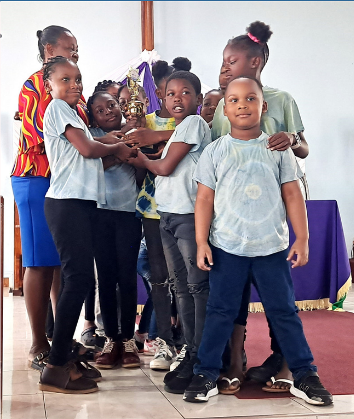
CHILDREN FROM BAILLIESTON ARE PROUD OF THEIR ACHIEVEMENT AT SRMC KIDS' QUAKE. (PAGES 8 AND 9)