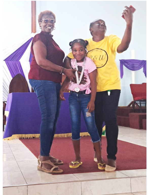
Much excitement as a child from Mount Airy receives a silver medal for poster design.