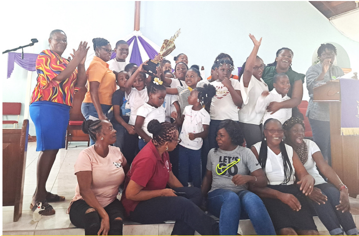
Bryce United were the overall champions for Kids Quake 2023