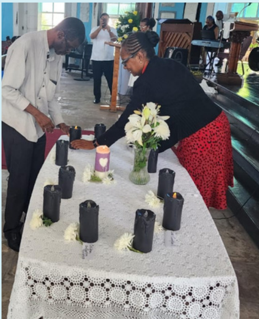
MEMORIAL SUNDAY 2023