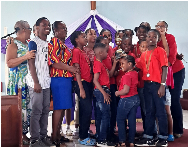
Ridgemount United receiving the second-place trophy.

This event aims to provide children with an opportunity to explore their God-given talents, develop confidence, fellowship with children from other congregations as well as to provide an additional opportunity for congregations to engage children in their community.