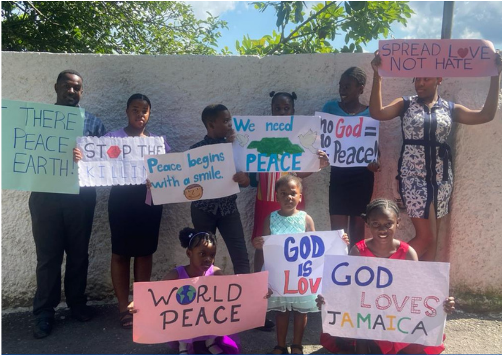
Oberlin United Church peach march on Sunday December 2, 2023