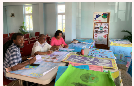
"JUDGES AT SRMC KIDS' QUAKE REVIEWING THE POSTER SUBMISSIONS. (PAGES 8 AND 9)

RISE UP MEN OF GOD AS WE CONTINUE IN THE 16 DAYS OF ACTIVISM AGAINST GENDER-BASED VIOLENCE IN THIS 31ST YEAR OF THE ANNIVERSARY OF THE UNION WHICH CREATED UCJCI. I AM CONCERNED THAT, IN THE FACE OF DISCRIMINATORY AND OFTEN DISGUSTING SPEECH AND BEHAVIOUR TOWARD WOMEN, THE CALL COMES FOR PROMINENT WOMEN AND WOMEN'S GROUPS TO SPEAK OUT AND DO SOMETHING WITHOUT A SIMILAR RESOUNDING CALL FOR MEN TO BE ADVOCATES. OFTEN THE MESSAGE TO THE MEN IS TO DO BETTER, TREAT WOMEN WITH RESPECT, REFRAIN FROM ABUSE AND IT IS RIGHT THAT SUCH IS THE MESSAGE. HOWEVER THEY ARE ALSO CALLED TO BE ADVOCATES AND ACTIVISTS. GENDER-BASED VIOLENCE WHICH IS MOSTLY AIMED AT WOMEN AND GIRLS IS A DISGRACEFUL PROBLEM FOR ALL, NOT JUST FEMALES. RISE UP, O MEN OF GOD.. (PAGES 6 AND 7)