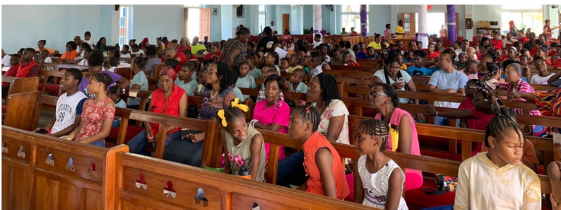
182 children accompanied by 75 adults attended the SRMC Kids Quake