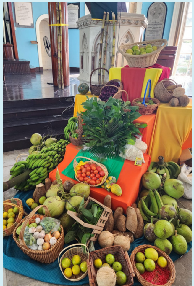
HARVEST SUNDAY 2023