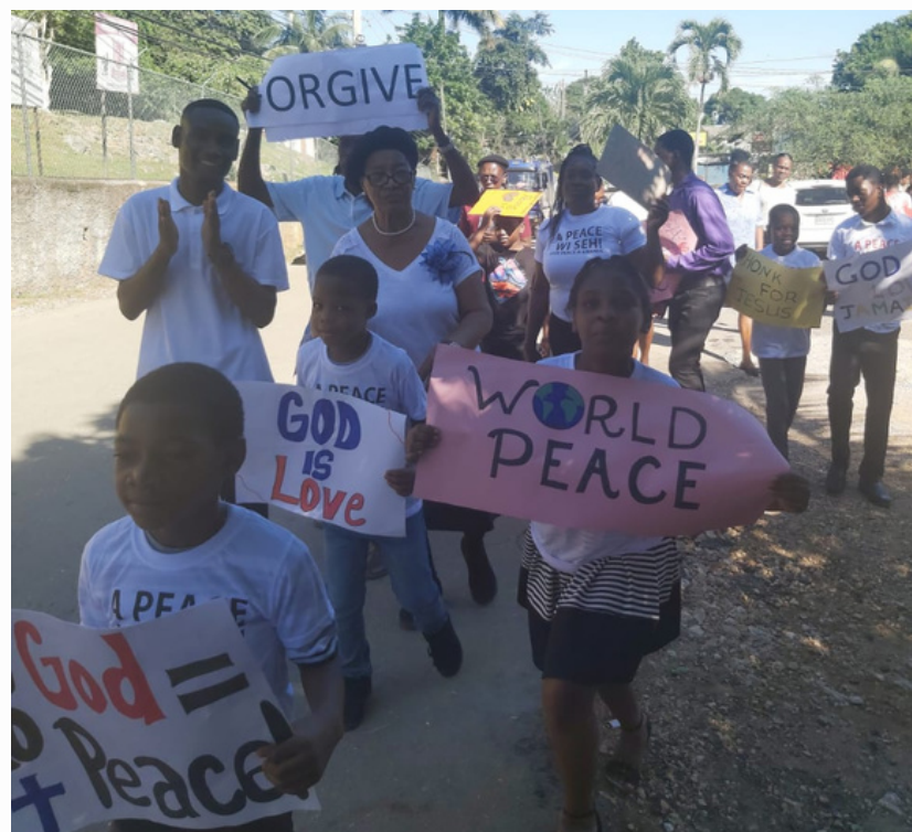
Mannings Hill United Church peace march on Sunday November 26, 2023

Church Schools have staged peace marches, held Children's Days in Sunday morning worship, and acknowledged the work of Church School teachers and administrators. The Children's Commission has also highlighted the ways in which former Church schoolers are presently impacting the Jamaican and Caymanian societies in positive ways. Let us continue to support our Church Schools.