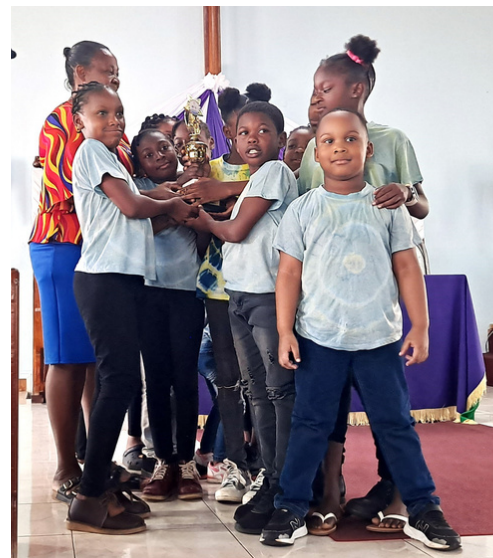
Baillieston placed third overall

Kids Quake 2023 was a resounding success. The event saw 182 children in attendance accompanied by 75 adults representing 16 congregations and one mission station. This marks a 10% increase in the number of children that participated in 2022 and an increase of participating congregations by two. Lowe River United Church received a special award for the most children in attendance with 32 children being present at the event.