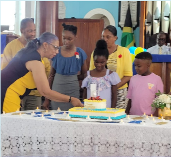
CUTTING THE BIRTHDAY CAKE