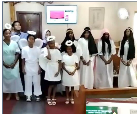
The Wise Men and the Angels (Gun Bay UC)