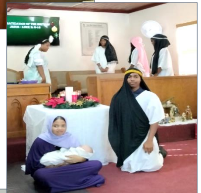
Mary, Joseph, the Wise Men and the Angels (Gun Bay)