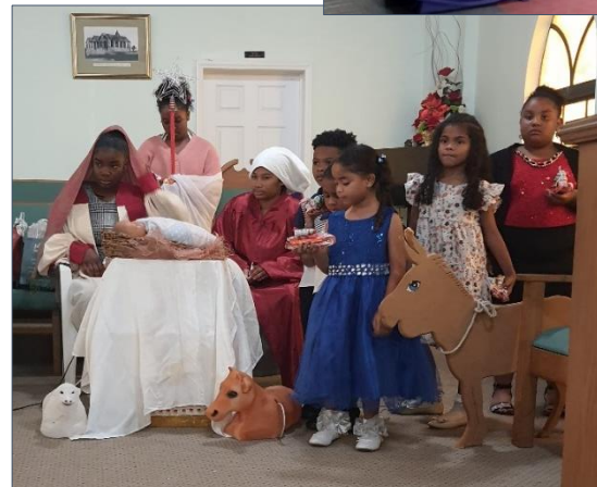
Mary, Joseph, the Wise Men and the Angels (East End UC)