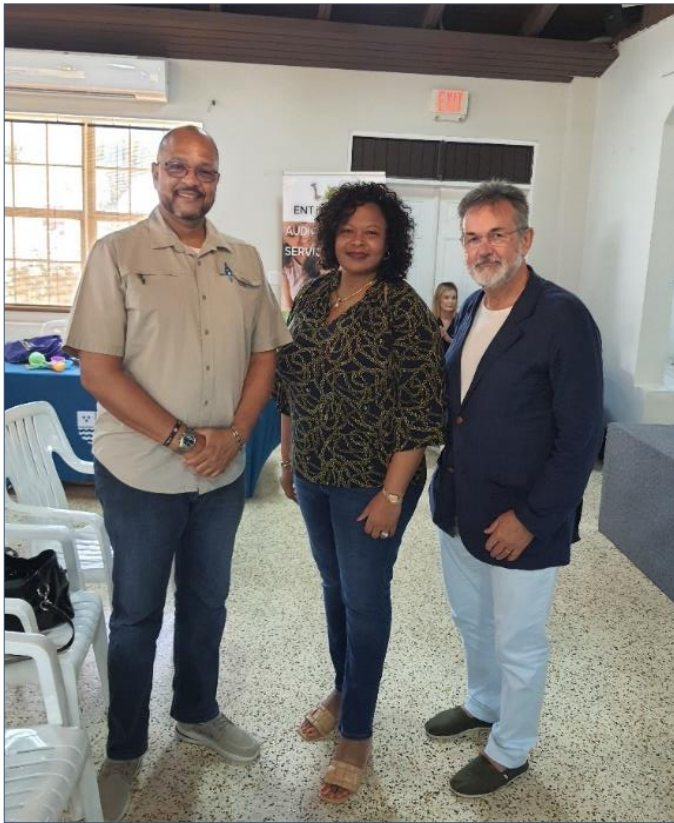
(L-R) The Hon. Isaac Rankin, MP for East End, The Hon. Sabrina Turner, Minister of Health as well as a member of the HSA team cut the ribbon for the opening of the day's activities.

Screenings (glucose, BP, etc.). Home Test Kits, random prizes, and surprises were the added gifts for all who attended. The event was a collaborative effort by the Rotary Sunset Club, Lions Clubs, HSA, DH, Health City Cayman, Cayman Heart Fund, and others to bring more screenings to the East End District.