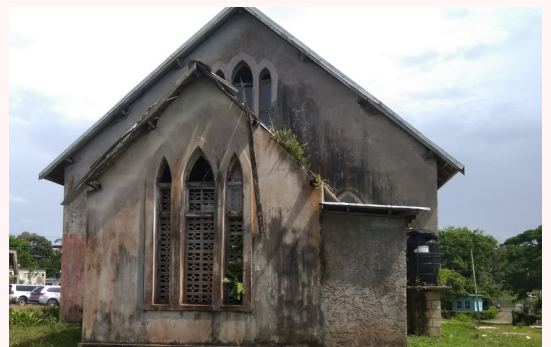
THE CEDAR VALLEY MISSION. (PAGE 3)

THIS IS THE QUESTION CONTEMPLATED IN THE WELL-KNOWN PASSAGE EZEKIEL 27 V. 3 IT IS THE VERY QUESTION BEING FACED BY UCJCI AS NERMCM EMBARKS UPON A MISSION OF RESTORATION AND REVIVAL IN THE ST. CATHERINE COMMUNITY OF CEDAR VALLEY. READ THE BEGINNINGS OF A JOURNAL OF MISSION AS WE TRACK THE EFFORTS AND DEVELOPMENTS OF THIS MISSION ENDEAVOUR. NOTABLY, IT IS THE COMMUNITY WHICH HAS INVITED THE CHURCH TO REVIVE THE WORK. WHAT BETTER SOURCE OF BECKONING COUPLED WITH THE COMMISSION OF CHRIST TO MAKE DISCIPLES? ONCE AGAIN, AS A UNITED CHURCH WE SEEK TO ACHIEVE OUR VISION- TOUCHING LIVES, NURTURING DISCIPLES, SEEKING TRANSFORMATION THROUGH CHRIST.