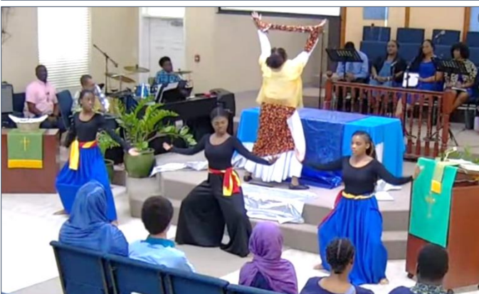
(Please check out the attachment sent with this newsletter, containing the message of the President of the United Church Young Adults Action Movement.)