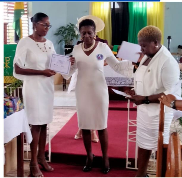
Southern Regional Mission Council Women's Fellowship service at Four Paths United.