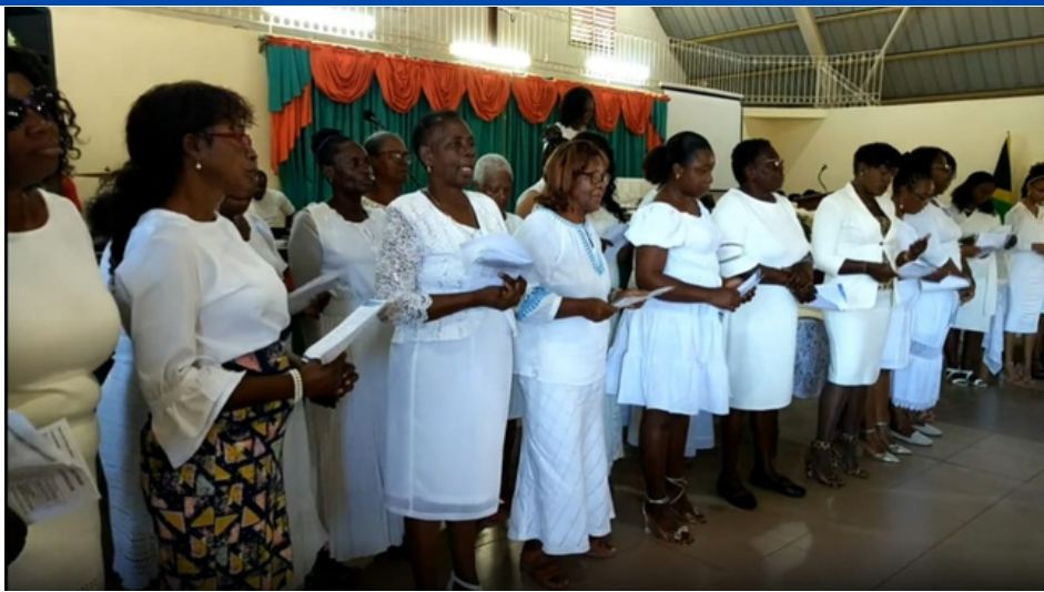
Western Regional Mission Council Women's Fellowship service and enrollment of new sisters.