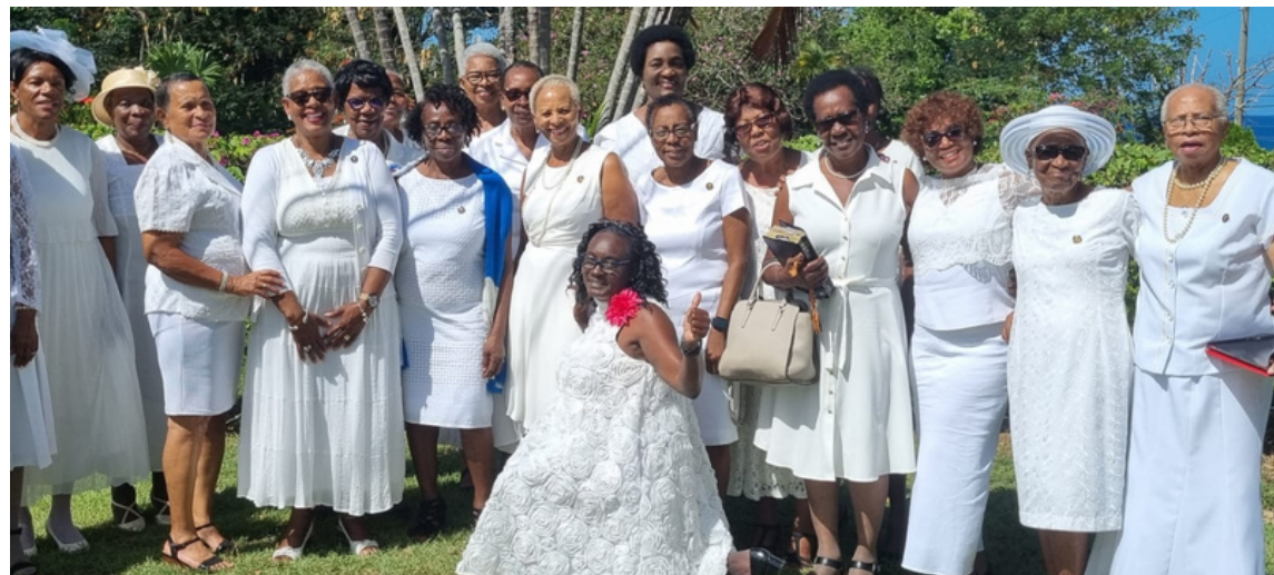
North Eastern Regional Mission Council Women's Fellowship service at Immanuel United.