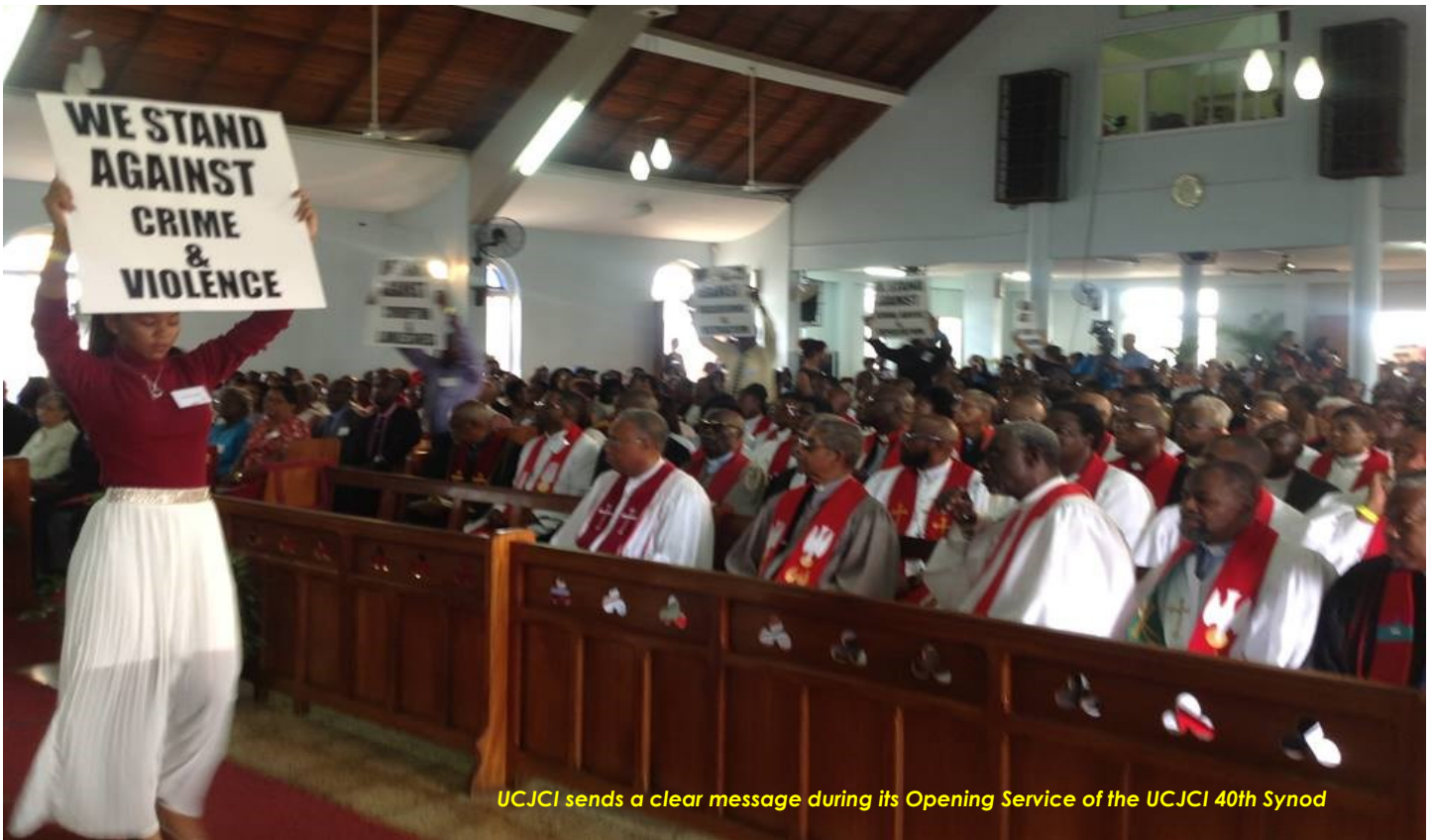
UCJCI sends a clear message during its Opening Service of the UCJCI 40th Synod