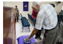
Lenten Memory Stones