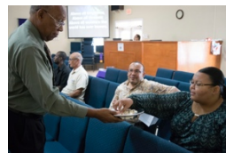
Sacrament of Holy Communion