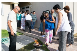
Burning of Confessions

Thanks to everyone who attended our Council's Ash Wednesday Gathering on March 1, 2017. The Gathering was a time for us to come together to praise and thank God for the many blessings we have received, to confess our sins and concerns to God and burn them as an act of removing the burdens from our lives. Breakout groups allowed us to confess our salvation, sins (systemic or individual), our sufferings/sicknesses/ and challenges, and there was even a group specifically for Men in prayer. The Gathering came to a close with the receiving of a cross of ashes, Holy Communion, and Lenten memory stones so all may remember the fellowship and confessions they made on Ash Wednesday.