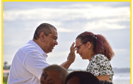
IMPOSITION OF ASHES AT ASH WEDNESDAY GATHERING IN CAYMAN.

I HAVE HEARD DECLARATIONS FROM PERSONS WHO ARE NOT COMMITTED CHRISTIANS THAT THEY WILL 'GIVE UP' SOMETHING DURING THE LENTEN SEASON. INSTEAD OF A CYNICAL RESPONSE TO SUCH DECLARATIONS COULD WE SEE THESE AS OPPORTUNITIES FOR CONSTRUCTIVE CONVERSATIONS? COULD WE ENGAGE OUR BROTHERS AND SISTERS TO HEAR FROM THEM AND SHARE THOUGHTS ON THE REASON THE CHRISTIAN COMMUNITY IS ENCOURAGED TOWARDS ABSTINENCE DURING LENT? LET'S SEIZE THESE OPPORTUNITIES TO ENCOURAGE THEM TOWARDS 'TAKING UP', SACRIFICIAL GIVING AND PRAYER WHICH ARE MEANT TO ACCOMPANY FASTING AT THIS TIME. LET US BE ON THE ALERT FOR OPPORTUNITIES TO SHARE OUR FAITH.