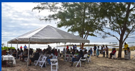
Gathering on the beach at Prospect.