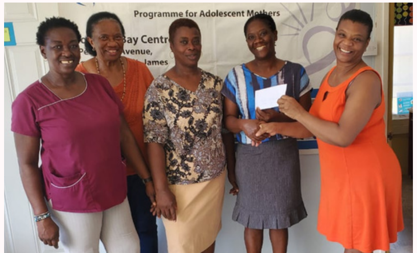
Financial contribution to a local nursing home.

Several branches in the region took to their communities to execute their project. In the Redway Cluster, St. Paul's United visited the AIDS Hospice and donated food and sanitation items.