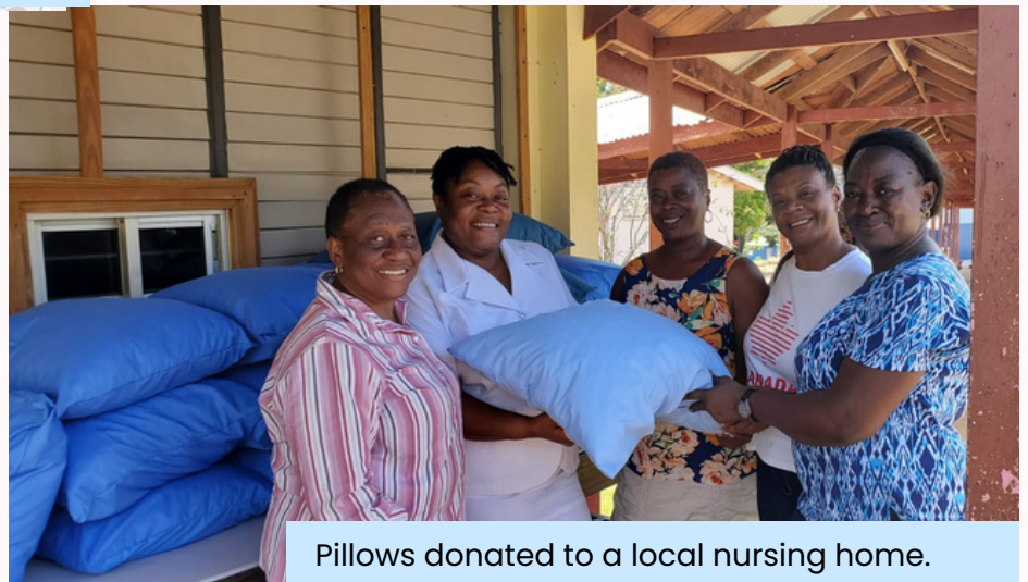
Pillows donated to a local nursing home.

Through their pillow project initiative, the ladies made and donated several pillows to a local nursing home and also made a financial contribution towards staff development and empowerment sessions for the ladies at the Women Centre of Jamaica Express. The ladies from the Goodwill United conducted devotion with the children from St. Peters School.