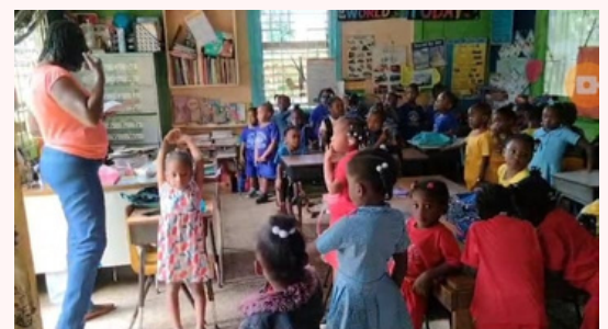
DEVOTIONS WITH THE CHILDREN WITH THE CHILDREN AT ST. PETERS SCHOOL. WAS LED BY THE LADIES FROM THE GOODWILL UNITED CHURCH IN WRMC

SOMETIMES MY HEAD SPINS WHEN I THINK OF THE NUMBER OF THINGS IN OUR WORLD THAT ARE NOT AS THEY SHOULD BE; THAT THE ABUNDANT LIFE TO WHICH JESUS REFERRED IN ST. JOHN 10:10 AND FOR WHICH HE CAME IS NOT BEING EXPERIENCED BY SO MANY PEOPLE. WHERE TO BEGIN? WELL, AT LEAST I HAVE LEARNED THAT, RATHER THAN CHOOSING TO BE OVERWHELMED BY IT ALL, I COULD CHOOSE SOMETHING AND DO MY BEST TO MAKE A DIFFERENCE, EVEN FOR JUST THAT ONE THING. THE WOMEN OF THE WEST HAVE PROVIDED AN EXAMPLE WORTH FOLLOWING. LET'S CHOOSE SOMETHING AND DO WHAT WE CAN. PLEASE SUPPORT 280 FOR HAITI. WE CAN DO THAT.