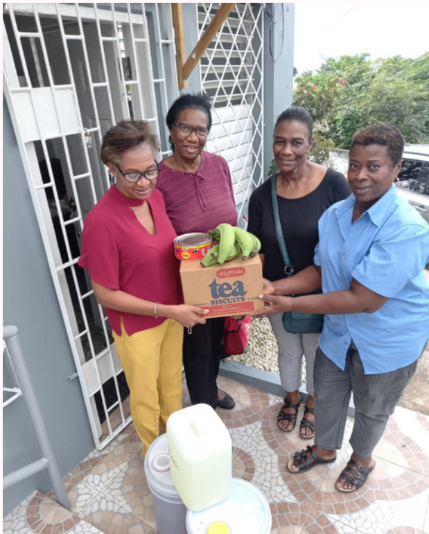
Food and sanitation items for AIDS hospice.