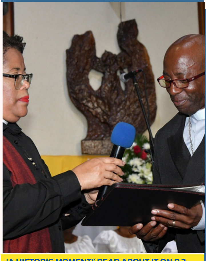
'A HISTORIC MOMENT!' READ ABOUT IT ON P.2

THE OFFICIAL WEEKLY NEWSLETTER OF THE UNITED CHURCH IN JAMAICA AND THE CAYMAN ISLANDS