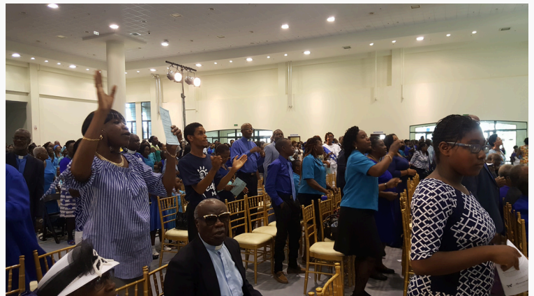
The church in worship at Convocation 2018.

Take a special offering that will be used to support the initiative, more specifically, to purchase instruments for the band