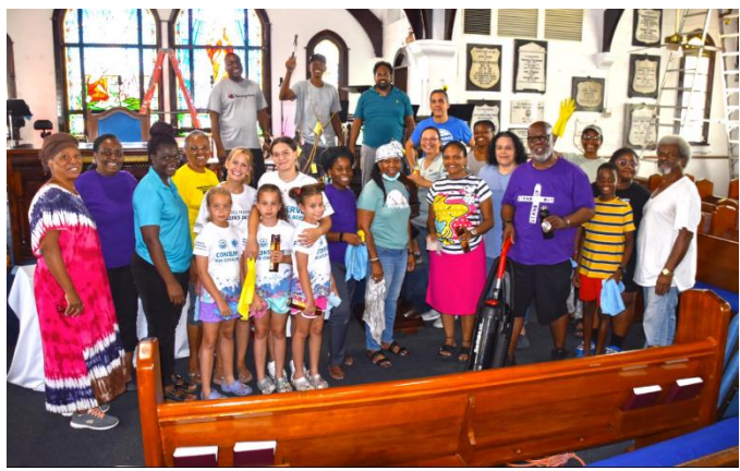
Some of the volunteers posed for a quick group photo.

Close to forty Congregants of all ages of the Elmslie Memorial United Church, George Town, gathered on Saturday, April 27, 2024, to assist with the spring cleaning of their Sanctuary. The Property Committee of the Congregation organized the event. Armed with enthusiasm and cleaning supplies, the volunteers tackled every nook and cranny in the building, cleaning the interior from top to bottom, leaving no corner untouched. Whether cleaning the windows, vacuuming the carpet, dusting the ceiling fans, or polishing the pews, each task was undertaken with a sense of purpose and pride. Others worked outside, power washing the exterior and attending to the plant beds.