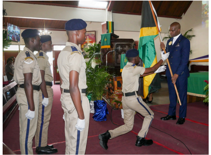
MEADWBROOK CADETS PARTICIPATE IN FLAG CEREMONY

View highlights or watch the full service on Meadowbrook United Church's YouTube channel.