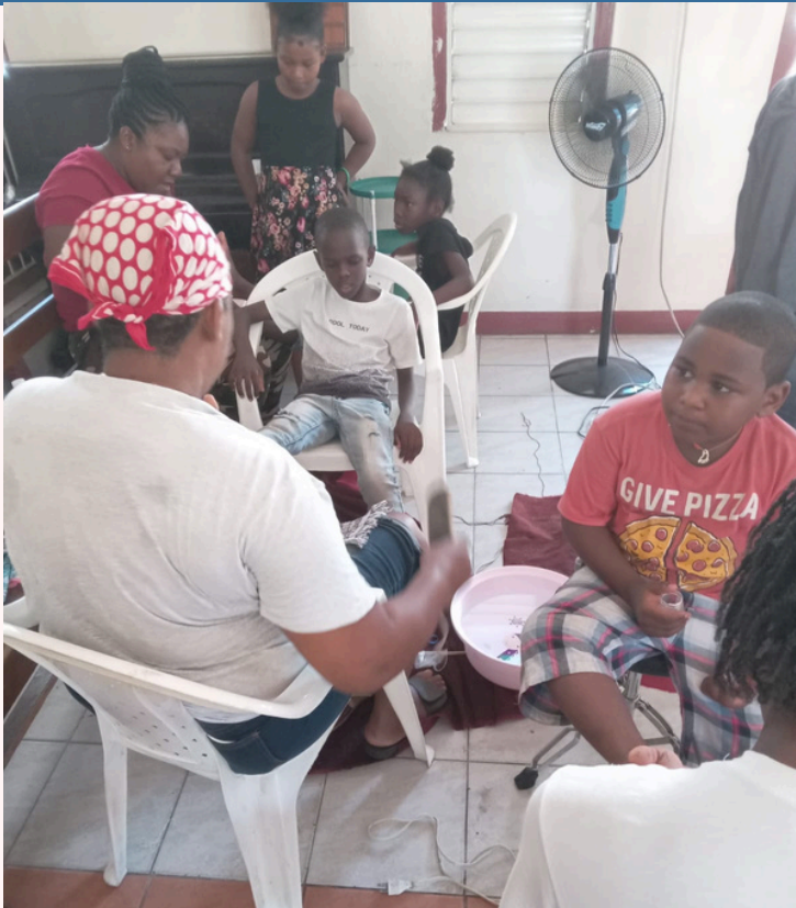
CHILDREN'S MINISTRY INITIATIVE LAUNCHED AT ST. PAUL'S MAVERLEY. (READ ABOUT IT ON P.6)