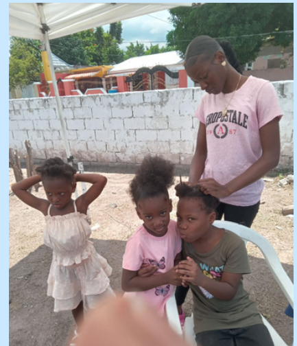
PERSONAL CARE FOR THE CHILDREN