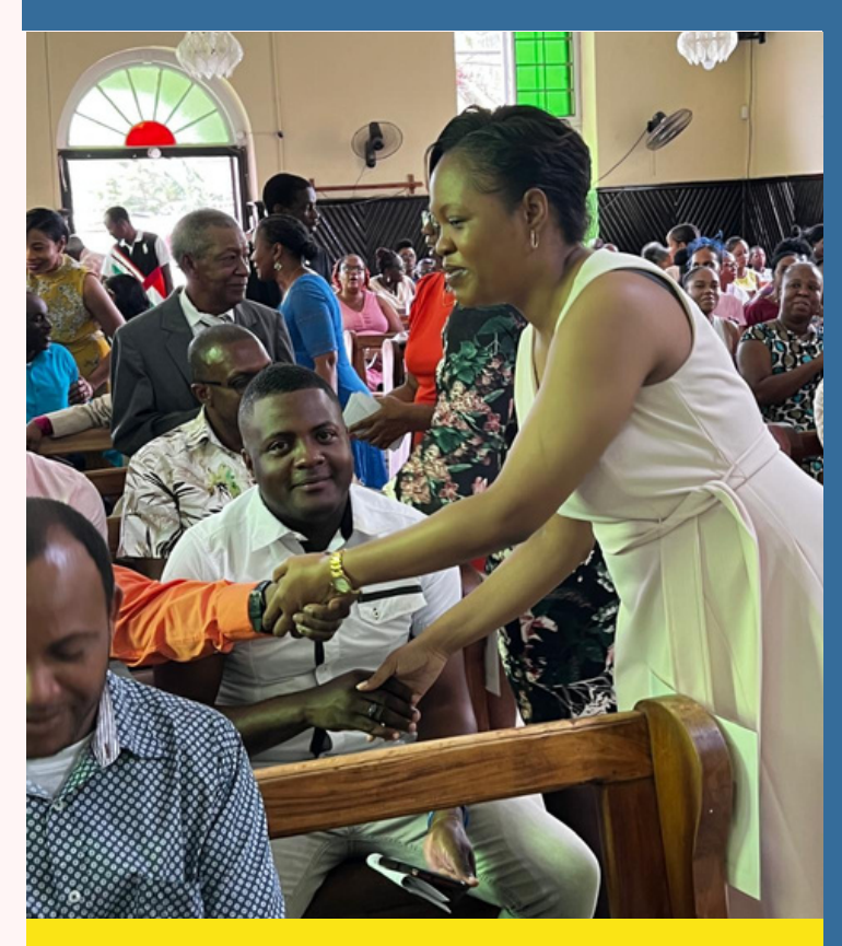
THE MEN WERE SPECIALLY WELCOMED, CELEBRATED AND FETED AT LUCEA UNITED ON FATHERS' DAY, P. 5